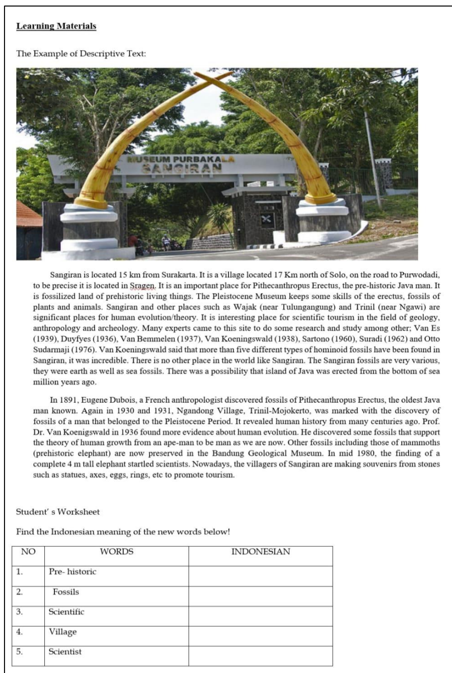
Figure 4. Teachers illustrate the wisdom of local culture in the design of teaching materials through descriptive texts.

In designing English teaching materials, teachers took a variety of examples from English texts through the tolerance curriculum. One of them is a descriptive text that promotes stories from local culture, as follows: