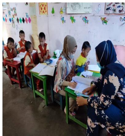
Figure 3. The teacher instructs the children to write 5 words