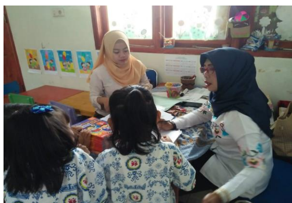
Figure 4. The teacher asks questions to the children

Activities like those listed above demonstrate how pop-up books can be used to foster children's language learning. Using pop-up books is only one way to help kids develop the language intelligence they need to become articulate speakers and writers. Children's linguistic intelligence is the language they'll use every day in conversations while sharing ideas, and when seeking information from others. The environment also has a significant role in shaping children's linguistic abilities. Teachers aren't the only ones responsible for expanding kids' vocabularies; parents do too, by teaching them how to string together words into sentences to express their needs. He has exceptional linguistic intelligence, particularly in terms of recognising different types of words; this allows him to take in what he hears, process it, and then articulate it in his own words. When a kid reaches this level of intelligence, he or she is still in the pre-operational stage of development, at which point he or she is still egocentric in speaking and prefers to talk to oneself when engaged in a game, but by the time he or she reaches kindergarten, he or she will begin to use the words he or she has acquired to ask questions. Educators who use pop-up books can make this a reality, particularly in the area of linguistic intelligence.