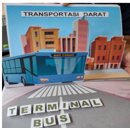
Figure 2. Transport theme pop-up book