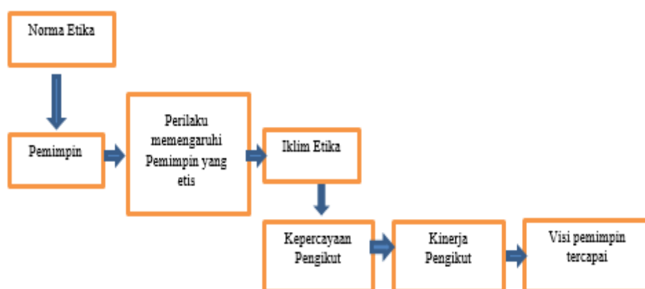
Figure 2. The Process of Applying Ethics in Leadership