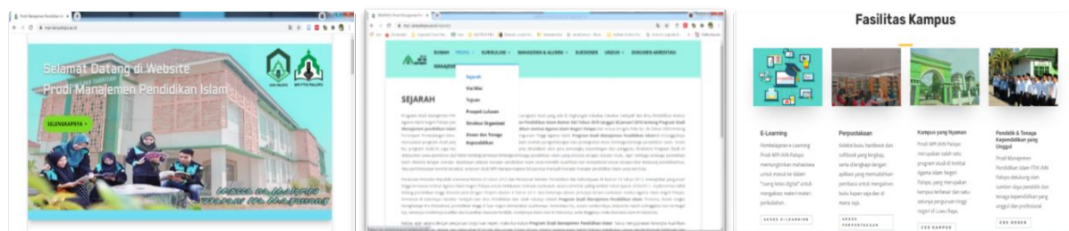
Figure 1 : Contents of the website

Download menu (containing Study Program documents, guidelines, and regulations, forms), and Accreditation menu.