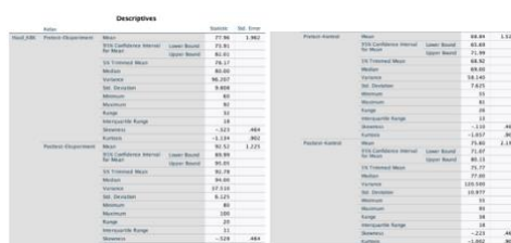
Figure 2. Descriptive statistical output of the picture of critical thinking abilities acquisition with project-based learning and task-based learning

The average score for developing critical thinking abilities was higher for students who studied with project-based learning than for students who studied with task-based learning, based on the results of the descriptive statistics response to research question (1). The reason is that project-based learning provides learning experiences to students through contextual problems in real situations, and learning is more student-centered. This is in accordance with the opinion of Rahmaton Wahyu (2016) that project-based learning provides students with meaningful learning experiences through contextual problems in real-world situations and is student-centered. Based on the curve slope value (skewness), the distribution of critical thinking ability scores of students who study with project-based learning is the same as students who study with task-based Learning, namely, the distribution is positively skewed. This means that both groups of scores tend to converge on low scores. The reason is that students do not have much practice experience working on critical thinking skills test questions.