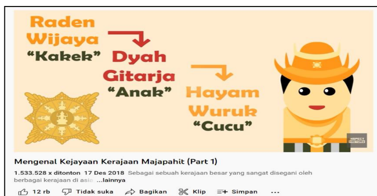
Figure 2. Inspect History Animation Video Footage

The Majapahit Empire stands as a remarkable testament to the greatness of ancient empires in the archipelago, evident through its enduring legacies. The animated video commences with an overview of the Majapahit kingdom, renowned for its resilience against Dutch colonization, followed by narratives featuring prominent national founding figures like Syahrir and Moh. Yamin, who drew inspiration from Majapahit as a symbol of Indonesian unity. Subsequently, the video delves into the early history and notable rulers of the Majapahit kingdom, highlighting figures such as Gajah Mada, whose stature is likened to renowned global leaders like Otto Van Bismarck and Niccolò Machiavelli. This narrative underscores the significant contributions of Indonesian figures during the kingdom's heyday, fostering a sense of national pride and identity.