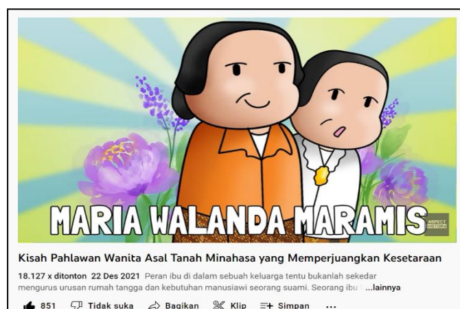
Figure 3. Inspect History Animation Video Footage (Source: https://youtu.be/xioMlr_s65w )

Additionally, another animated video showcases the story of a heroic woman from Minahasa, advocating for gender equality, released in commemoration of Mother's Day. This video has garnered 18 thousand views, 851 likes, and 99 comments, illustrating its impact and engagement with the audience. The video emphasizes the significant role of women in Indonesian history, presenting an empowering narrative that aligns with contemporary values of gender equality. By highlighting these diverse historical figures and themes, Inspect History not only educates its viewers about Indonesia's rich past but also connects historical narratives to current social issues, thereby making history relevant and engaging for modern audiences. The success and engagement metrics of these videos reflect the effectiveness of using animated storytelling to convey historical content in a compelling and accessible manner.