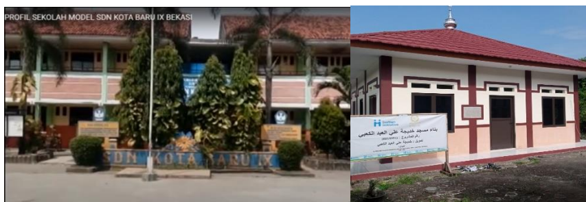
Picture 1. Infrastructure in the form of school buildings and prayer rooms donated from the Foundation at SDN Kota Baru IX

From Picture 1, it can be seen that there are many classrooms at SDN Kota Baru IX, as well as a fairly large school field. The number of classrooms can be seen from the two-story building. The building looks very usable.