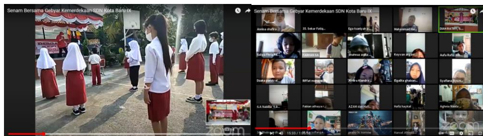
Picture .4. Celebration of the 76th Republic of Indonesia's Anniversary with Hybrid gymnastics

In Picture 4, it can be seen the support from parents, and enthusiasm from students and educators in celebrating the 76th Indonesian Independence Day. Pictures 4 and 5 also show that SDN Kota Baru IX, Bekasi City is making maximum efforts so that the teaching and learning process continues as optimally as possible, even during the COVID-19 pandemic.