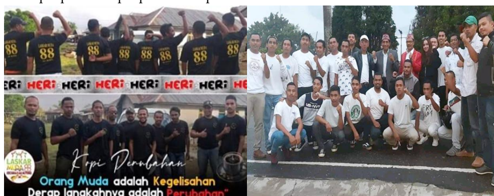
Figure 3. Declaration of 88 and Foreder Warriors Volunteers somewhere in Ruteng City