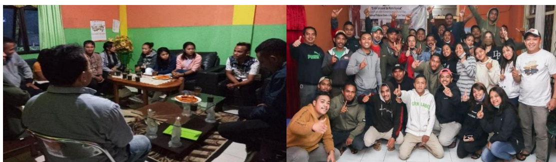
Fig 5. The author had a political discussion with the volunteers

Based on the results of this interview, the author concluded two things: first, the community of political volunteers in the Manggarai election has an ideological purpose and nature. This ideological purpose and nature appear in the picture of young people's bargaining positions when the candidate is elected. This bargaining position becomes one of the images that the struggle of these volunteers is