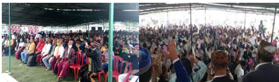
Figure 4. During the H2N and DM campaign attended by Laskar 88 and Foreder