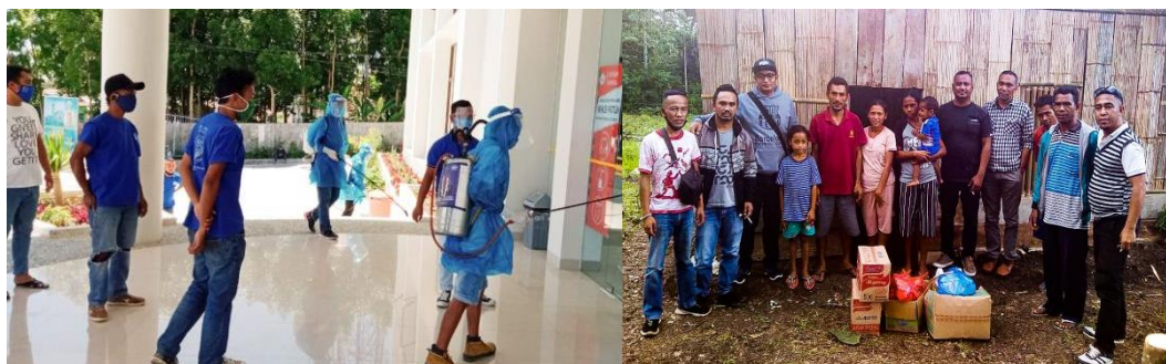
Figure 2. Foreder Wing "Granat" and Laskar 88 are spraying disinfectant and sembako aid to the poor

very decisive. Critical awareness becomes the basis of power in designing social order or construction that leads to the creation of welfare and social justice. (Tamanna, 2018; Diemer, - Li, 2011). When politics on essentially Aimed at improving well-being and social justice, critical awareness is part of the trigger. The critical awareness of young Manggarai people towards politics is seen in the content of arguments when considering political choices or preferences. In conversations on facebook facilitated by a group titled "Manggarai Free to Argue (MBB)", each other