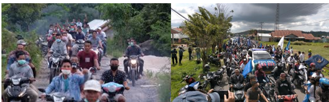
Figure 9: Masa Laskar 88 and Foreder march with candidates