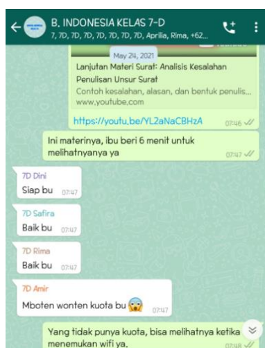
Figure 2. Text Letter Learning Use Ruang Bahasa I.d

The implementation of learning is the most important stage in a teaching and learning activity. To get the data about the implementation of Ruang Bahasa I.d in learning, it is done by documenting the screenshots of the teacher's learning. The text of the letter learning using the Youtube Ruang Bahasa I.d was done using the Whatsapp group. The time allocation used is 2x40 minutes. The steps for implementing the Ruang Bahasa I.d Youtube channel in learning letter text are as follows.